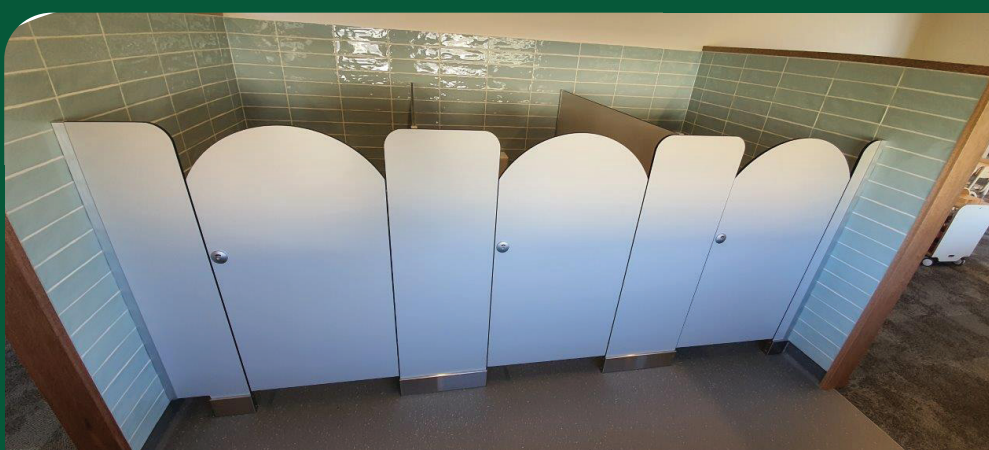
Woodcroft College Early Learning Centre Sarah Constructions Adelaide, SA